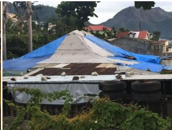
Roofs of Operation Youth Quake and current Grotto Home for the Homeless